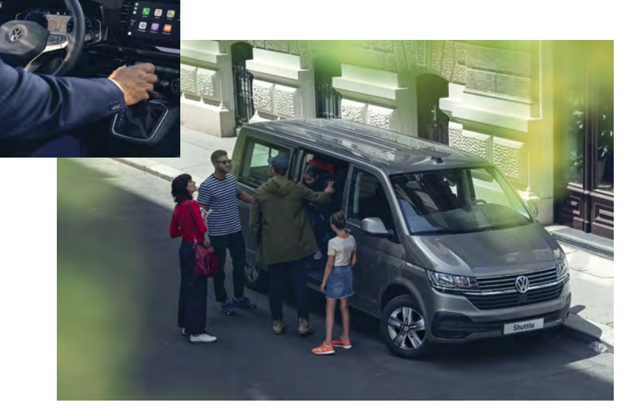
All images shown are for illustrative purposes only. Vehicles shown are not UK specification.