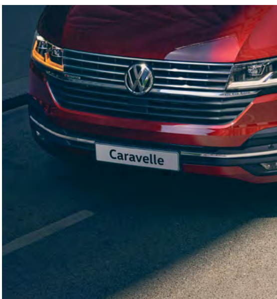
Images shown are for illustrative purposes only. Vehicles shown are not UK specification.