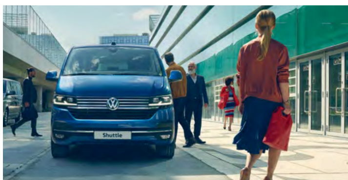
Images shown are for illustrative purposes only. Vehicle shown is not UK specification.