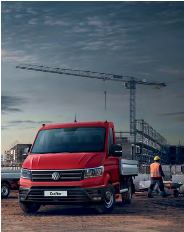
Images shown are for illustrative purposes only. Vehicles shown are not UK specification.