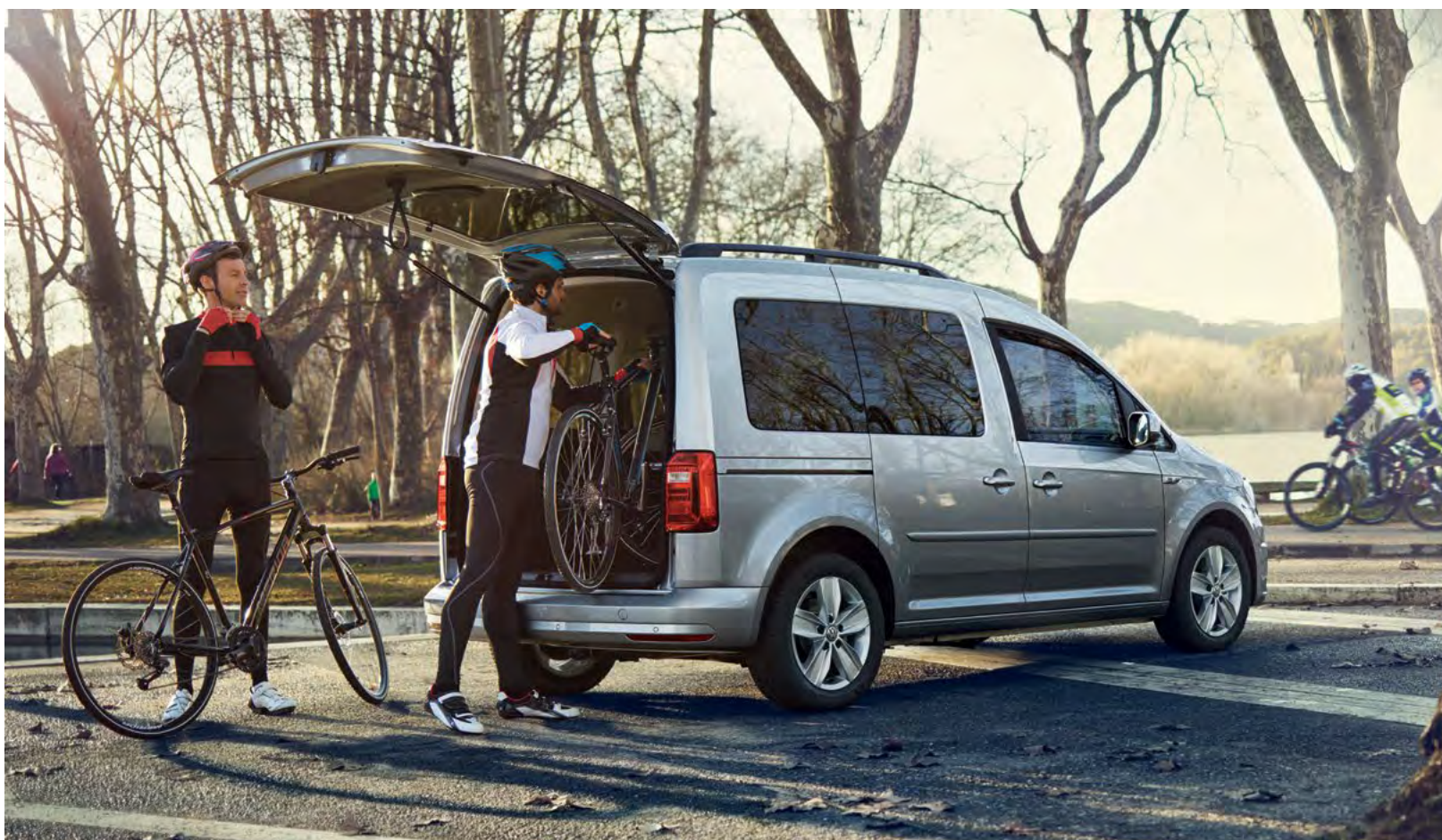
Image shown is for illustrative purposes only. Vehicle shown is not UK specification.