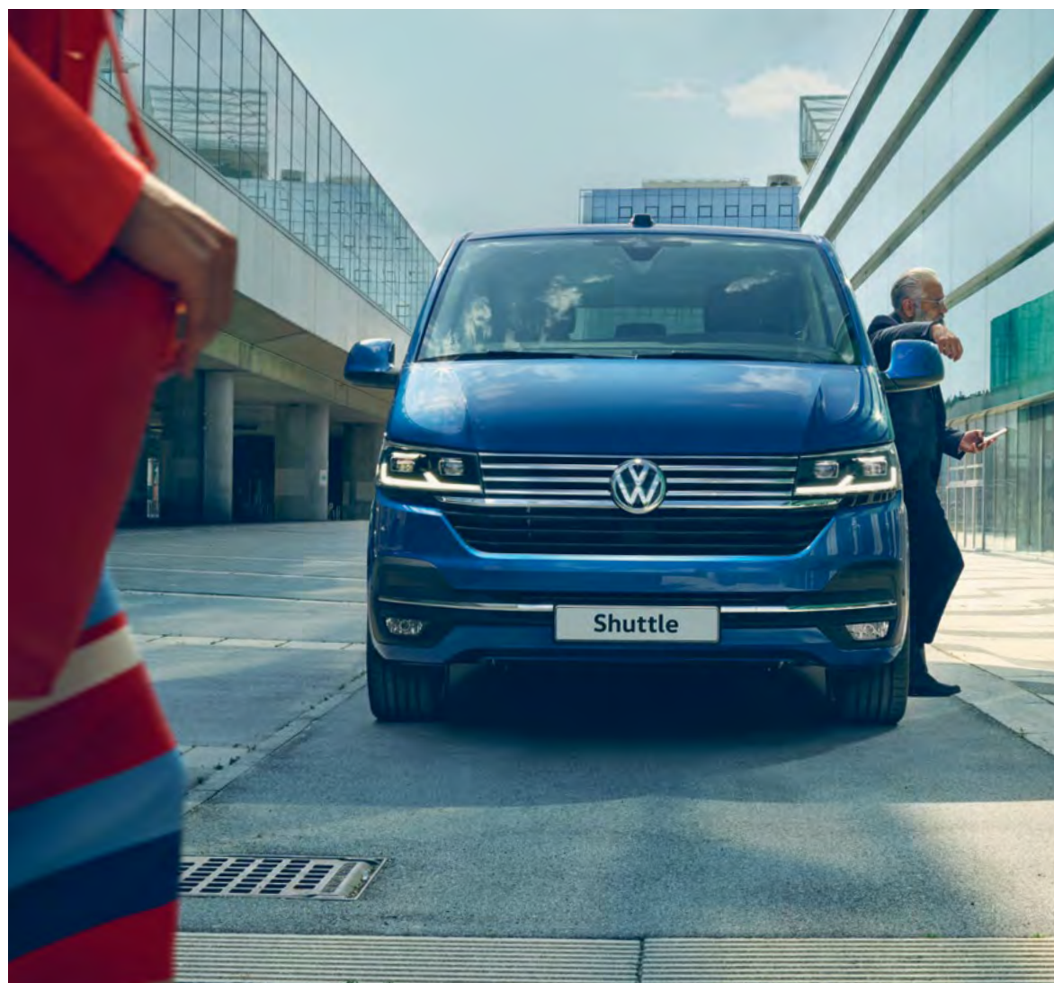
Image shown is for illustrative purposes only. Vehicles shown are not UK specification.