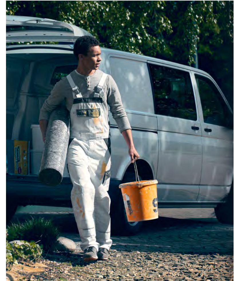
Image shown is for illustrative purposes only. Vehicle shown is not UK specification.

If your personal information is stored outside of the UK, we will require your personal information to be protected to UK standards. Further information on how your information is used, how we maintain the security of your information, your right to access information we hold on you and details of relevant third party and Volkswagen Group companies for data sharing purposes is in our Privacy Policy, which is referred to above.