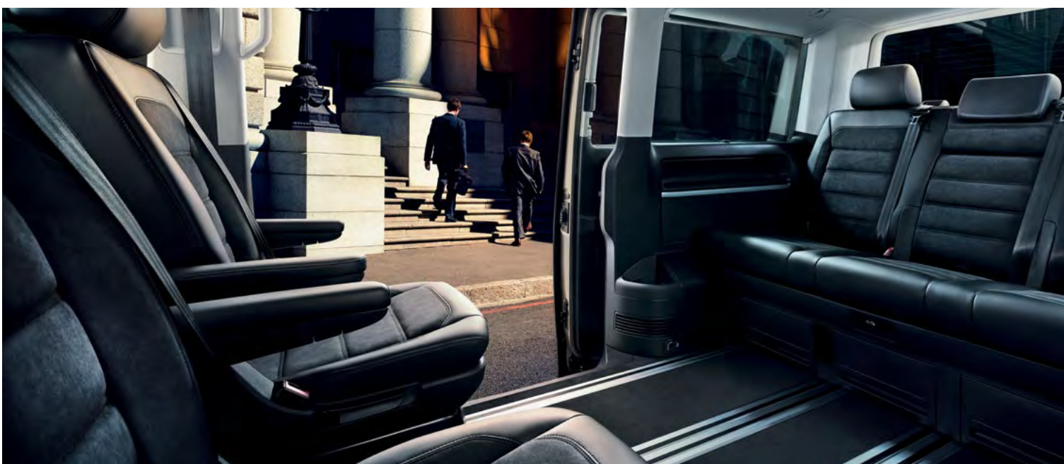
Interior shown is Caravelle Executive. Please contact your local Volkswagen Commercial Vehicles Van Centre for details of the standard equipment and optional extras available.