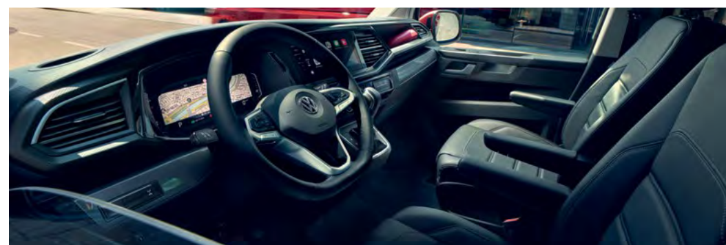
Interior shown is Caravelle Executive