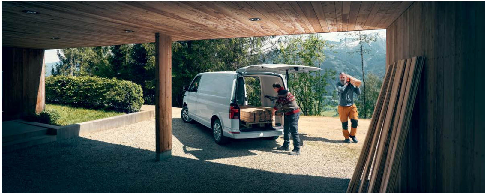
Image shown is for illustrative purposes only. Vehicle shown is not UK specification.