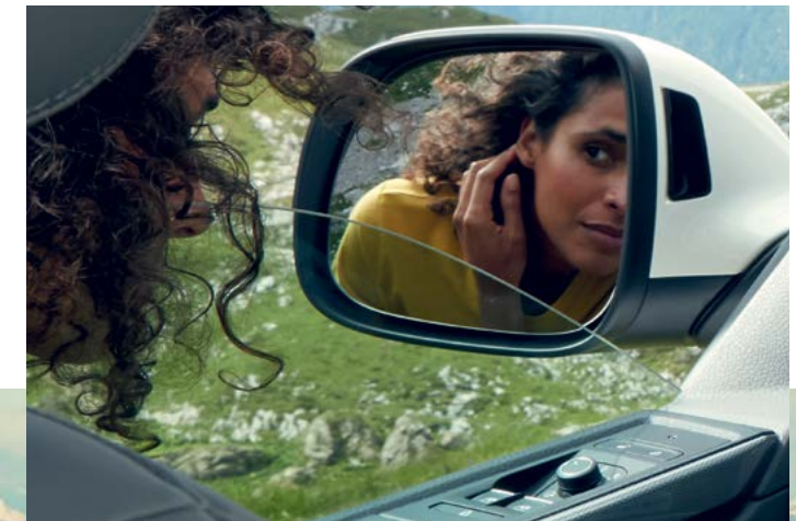
Image shown is for illustrative purposes only. Vehicles shown are not UK specification.

We will pay for the costs of repairing or replacing the factory-fitted mechanical and electrical components of your vehicle that have suffered sudden failure during the period of cover subject to the maximum claim limit and the terms and conditions of this policy.