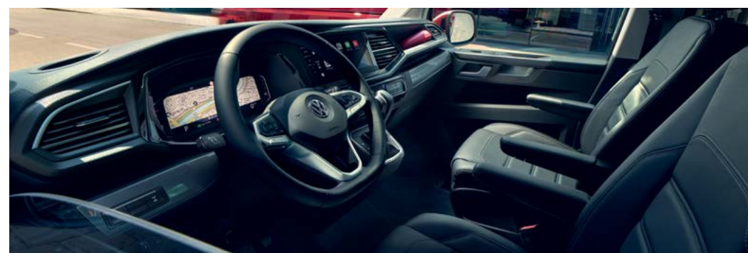
Interior shown is Caravelle Executive