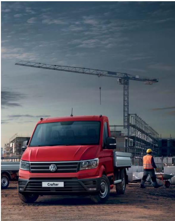
Images shown are for illustrative purposes only. Vehicles shown are not UK specification.