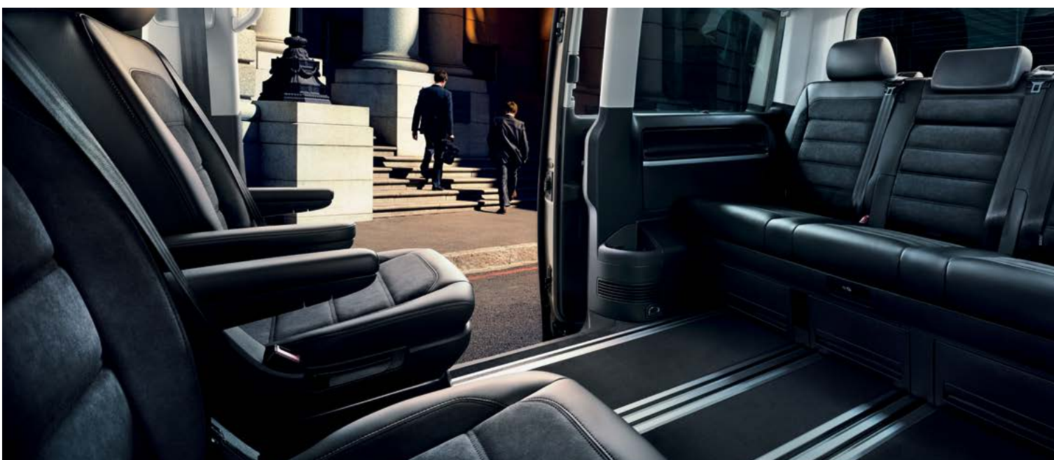
Interior shown is Caravelle Executive. Please contact your local Volkswagen Commercial Vehicles Van Centre for details of the standard equipment and optional extras available.