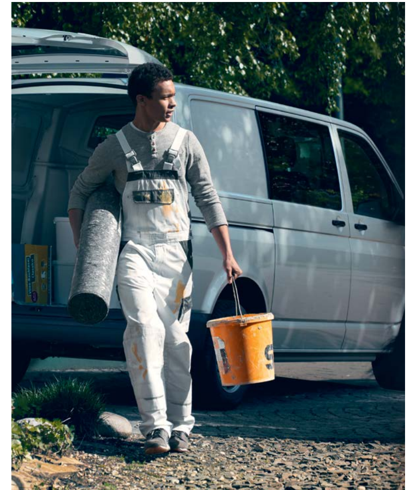
Images shown are for illustrative purposes only. Vehicle shown is not UK specification.