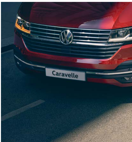
Images shown are for illustrative purposes only. Vehicles shown are not UK specification.