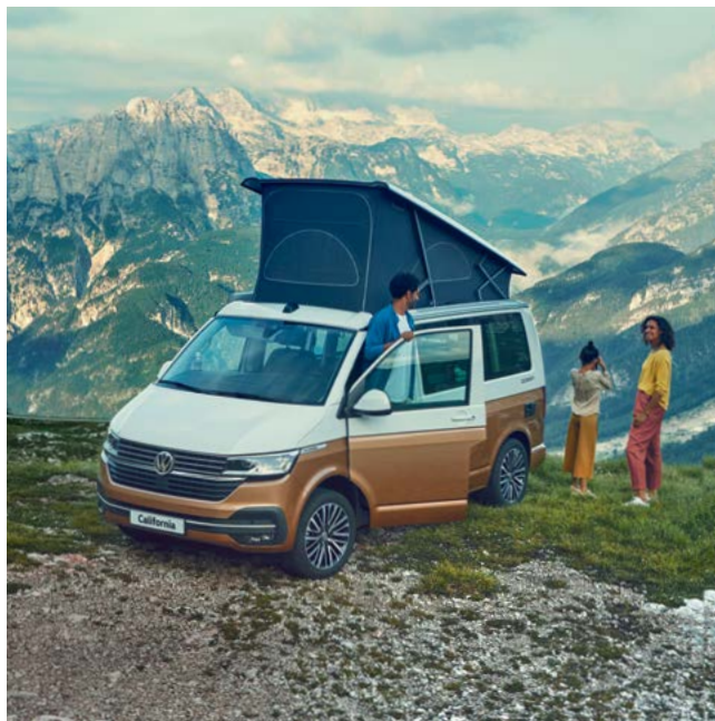
Image shown is for illustrative purposes only. Vehicle shown is not UK specification.

When your vehicle is declared a total loss , please contact us . You will need your certificate of insurance and vehicle registration to hand. You can contact us :