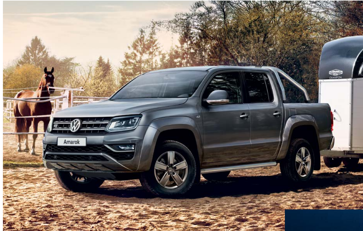
Images shown are for illustrative purposes only. Vehicle shown is not UK specification.

If you have any difficulties reading this document, please contact the Customer Services Team.