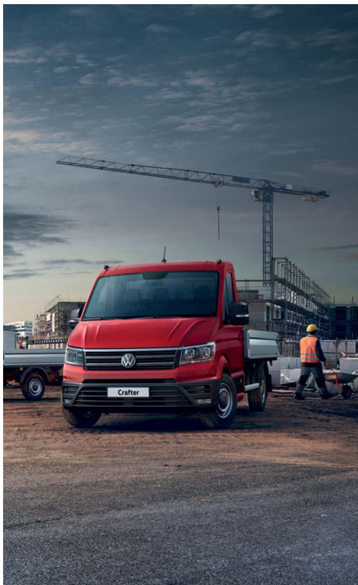
Image shown is for illustrative purposes only. Vehicle shown is not UK specification.