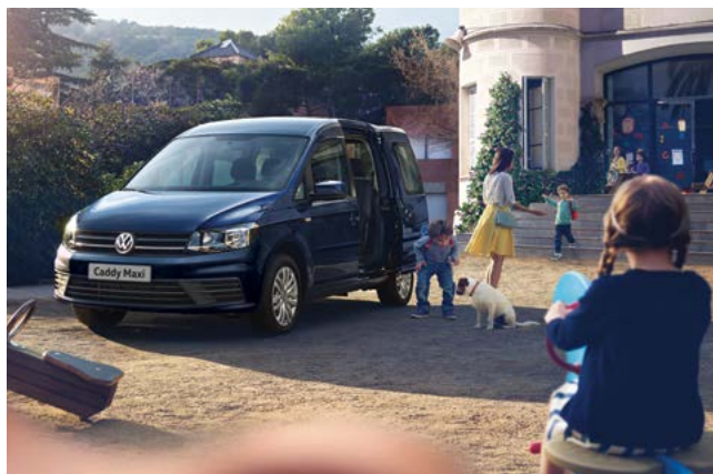
Image shown is for illustrative purposes only. Vehicle shown is not UK specification.

These words have the following meaning throughout this policy, where highlighted bold: