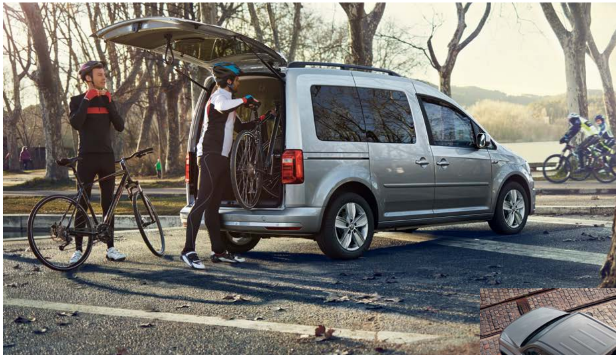
Images shown are for illustrative purposes only. Vehicles shown are not UK specification.