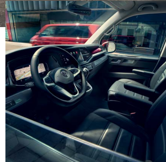
Interior shown is Caravelle Executive