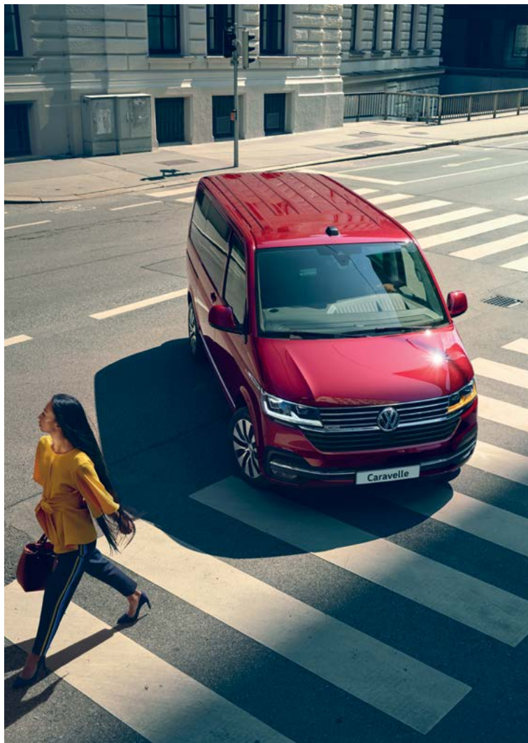
Image shown is for illustrative purposes only. Vehicle shown is not UK specification.